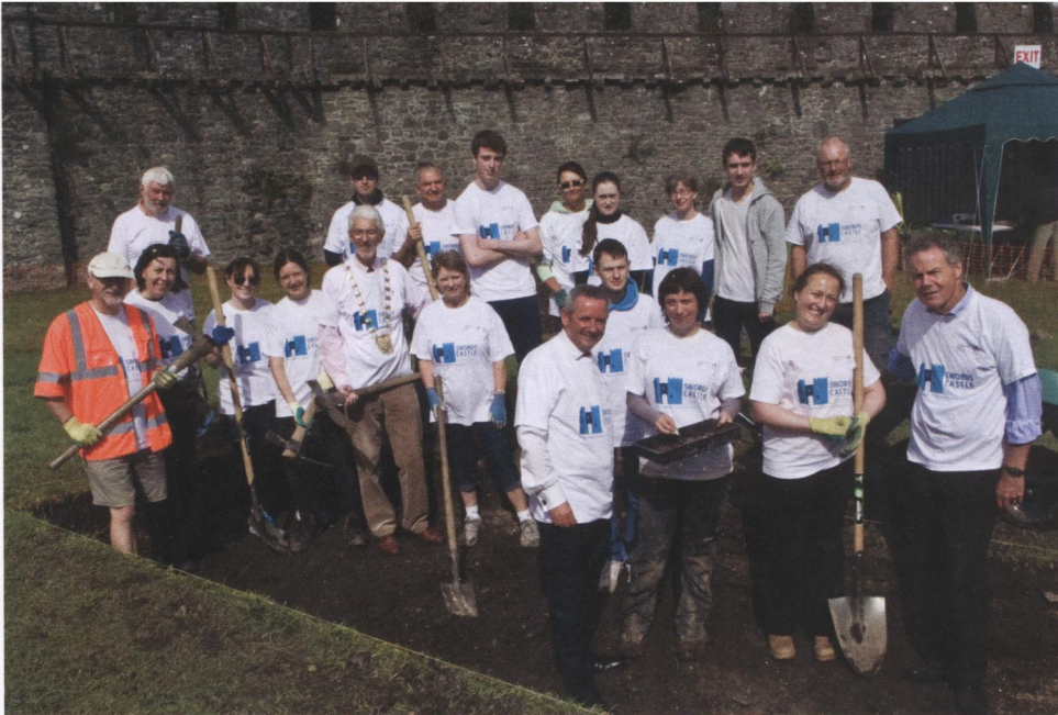
Left: 'Digging History' launch day.