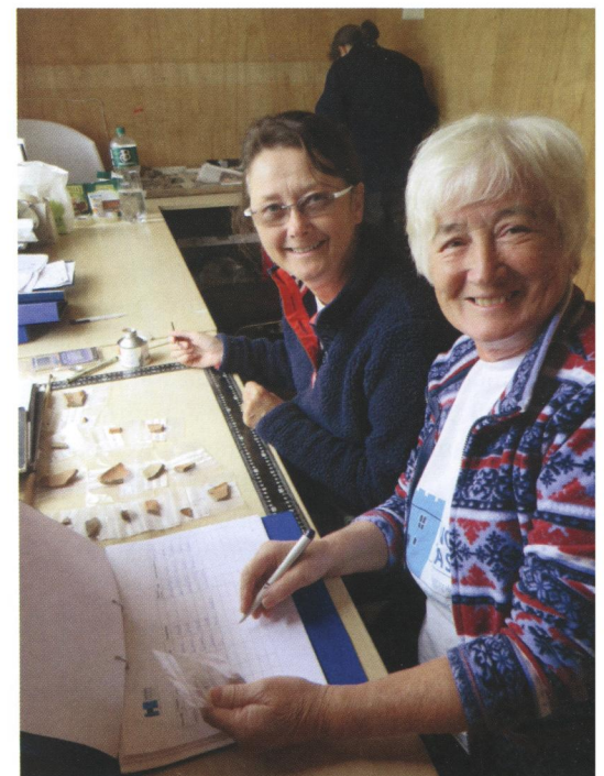
Archaeology Ireland Winter 2015

Thanks to my colleagues on site, in FCC and the National Museum, and to all who supported the project by taking part or by visiting us. You can see us on https://www.facebook.com/Swords-Castle-Digging-History-110731409262325/?ref=hl .